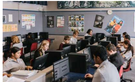
Workshops and Computer Laboratories