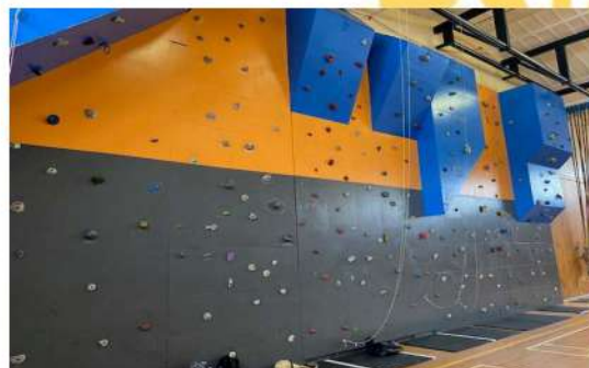
Indoor Climbing Wall