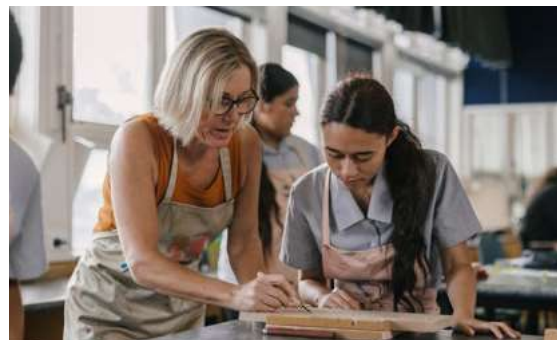
Art and Design