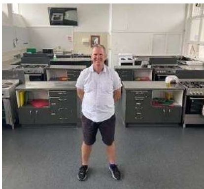
Food and Textile Technology suites