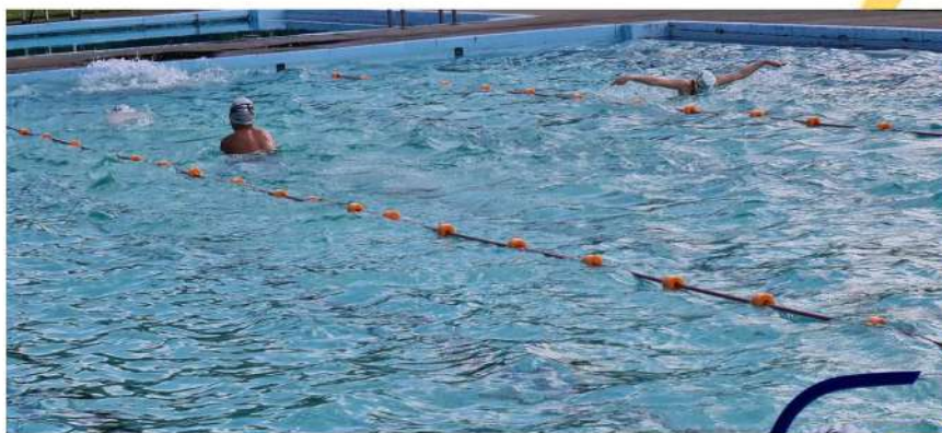
Swimming pool and diving pool