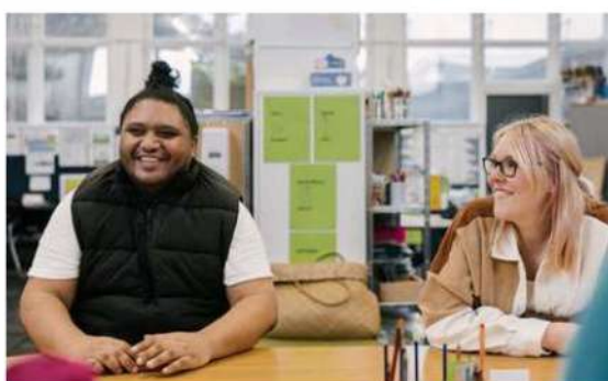
Student Support Centre