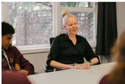
Careers Resource Centre