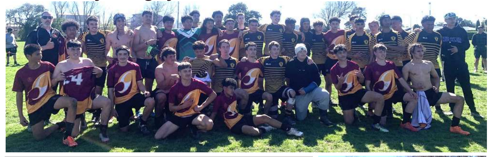
QEC 1st XV vs Awatapu College 1st XV

A much anticipated final, played in perfect conditions at Queen Elizabeth College.